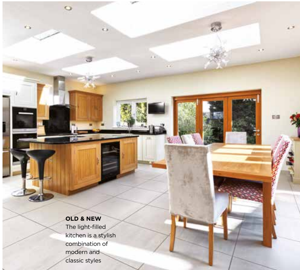
OLD & NEW The light-filled kitchen is a stylish combination of modern and classic styles